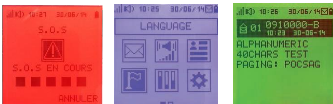
Friendly user interface - Display with color backlight

Contact Multitone for more details ; info@multitone.com or 01256320292